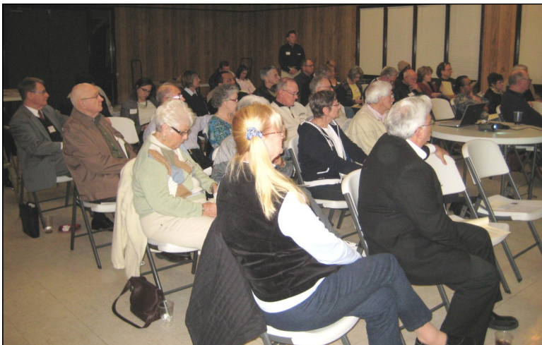
Some of the 50 plus residents that participated in the meeting.