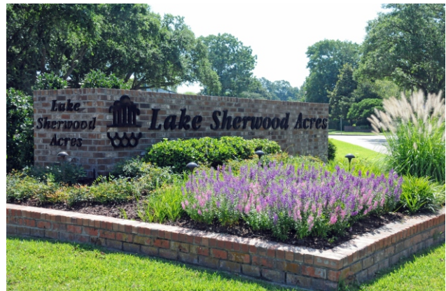
North Entrance on Sherwood Forest Blvd

The neighborhood was developed by Victor Coursey in 1974 when Sherwood Forest Blvd was extended south of I-12 to Airline Highway. This area was considered far from downtown. Today, shopping centers, coffee shops, and retail businesses surround Lake Sherwood. There are more than 50 restaurants located within two miles.