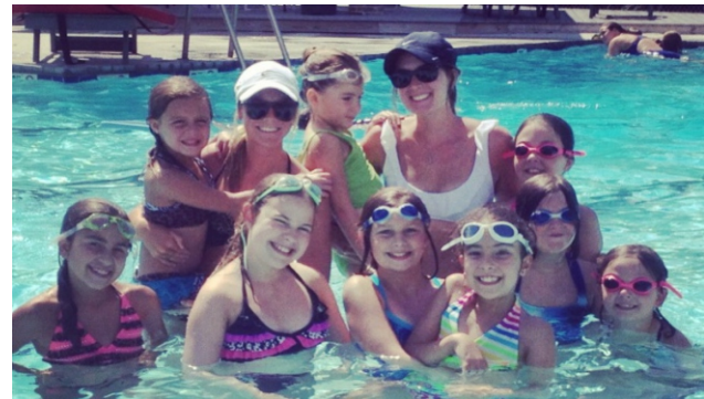
“Sharks” Junior Swim Team and coaches