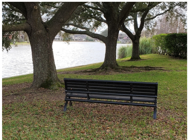
Lake view from one of two Common Areas